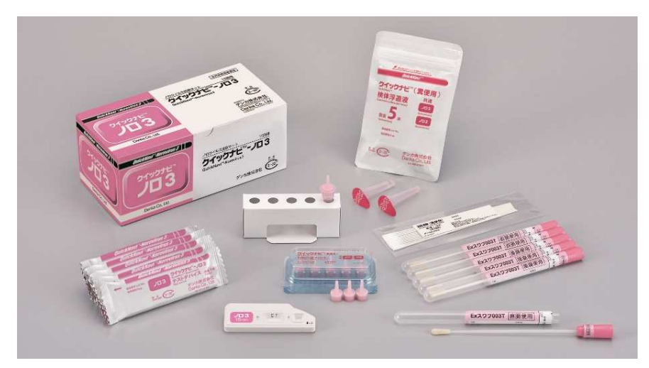
QuickNavi<sup>TM</sup>-Noro 3, Rapid Antigen Test for Norovirus

New release of QuickNavi<sup>™</sup>-Noro 3, a Rapid Antigen Test for Norovirus, on October 26 in Japan — Higher Sensitivity to Various Genotypes —