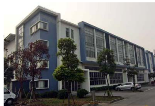
in the Suzhou Industrial Area

Facilities and equipment for evaluating and testing properties and performance, as well as analyzers of rubbers and adhesives