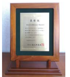
Certificate awarded by Ichihara City