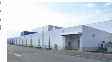
No. 56 Building established at the Kagamida Plant

In recent years, we have experienced no major occupational accidents and facility-related incidents thanks to risk assessments and proactive initiatives undertaken by the Safety and Health Committee. As the scope of our corporate activities is growing, we will give due consideration to safety in the course of construction and expansion work.