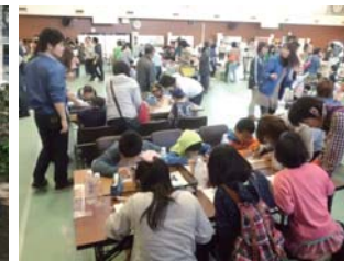
Many children were attracted to the stand run by plant staff