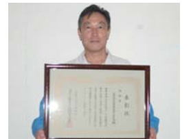
Award certificate from the head of the Kanagawa Labour Bureau