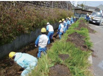
Cleaning Nakamura Waterway