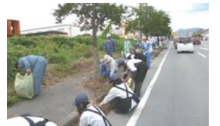
Voluntary cleanup activity

load reduction activities while cutting waste emissions.