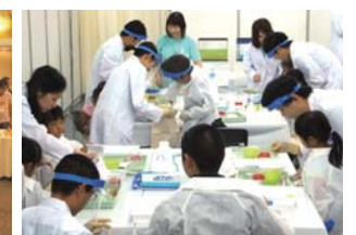
The Summer Holiday Chemical Experiment Show for Children