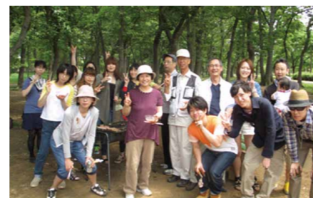
Barbeque party held to welcome new recruits

To deepen interaction with local communities, each plant is participating in initiatives hosted by the industrial complexes to which they belong. For example, they take part in cleanup activities while supplying their container products for use in local industrial festivals. Going forward, we will step up efforts aimed at facilitating communications, building robust partnerships in which we can support one another in emergencies as a community member.