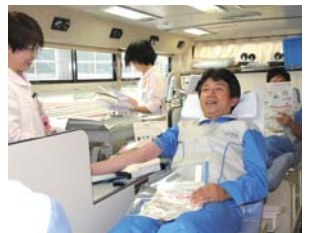
Blood donation campaign