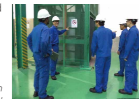
Patrolling the worksite

Fortnightly safety patrols allow us to keep an eye on employees' observance of the "5S"* and avoidance of unsafe practices while identifying potential dangers. The findings of the patrols are reported at safety meetings and appropriate countermeasures are taken. Looking ahead, we will undertake a near-accident reporting initiative while encouraging employees to attend various safety-related training sessions and acquire relevant qualifications.