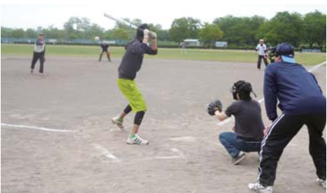
A spring softball game

The Shibukawa Plant holds softball games and sports festivals in every spring and autumn, respectively, with management and the labor union as co-sponsors. Every year, a number of employees and workers from subcontractors as well as their families attend these events, taking advantage of the opportunity to facilitate communication that transcends workplace boundaries. Looking ahead, we will regularly hold various events aimed at enhancing communication.