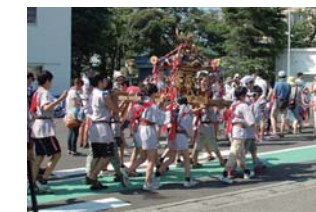
Summer festival held by a neighborhood association

tinue our efforts to facilitate dialogue and interaction with local community.