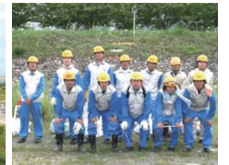
Plant staff who participated in the Himekawa River Cleaning Mission