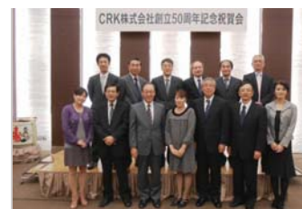
The 50th anniversary celebration