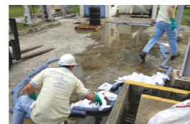
An emergency drill aimed at containing a chemical leak

One plant employee acquired an energy manager qualification in line with the Singaporean government's energy saving policies.