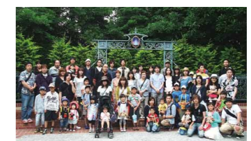
Employees and their families on a bus tour

To facilitate communication with local residents, we engage in periodic cleanup activities with them to maintain parks and streets in the vicinity of the plant.