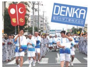
The Omuta Daijaya Festival