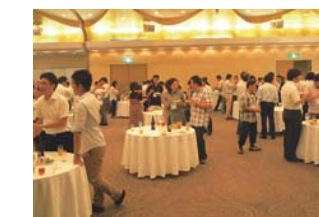
Innovation FESTA was a roaring success

* A campaign launched in Japan in 1993 to facilitate people's understanding of chemistry and the role the chemical industry plays in society.