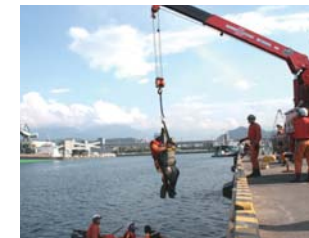
Rescue training at Himekawa Port Comprehensive Emergency Drill

To secure preparedness in case of chemical facility-related accidents, we have implemented a variety of disaster drills, including a comprehensive emergency drill undertaken in tandem with the Itoigawa City Fire Department. Assuming a fire breaking out at a plant facility, this joint drill involved 12 activities, including initial reporting to the fire department, extinguishing and rescuing people from fires, and final confirmation of fire extinction, to ensure that these actions are swiftly taken. We also participated in the Himekawa Port Comprehensive Emergency Drill, in which it was assumed a major earthquake had occurred.