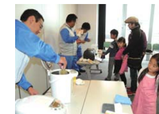
Children making personalized PET bottles at the Omuta Ecotown Fair

Having participated in the Omuta Daijaya Festival, a summer festival that dates back 300 years, a total of approximately 100 plant staff joined the main attraction of the festival entitled "10,000 people's dance."