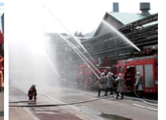
Fire extinction training at the plant's comprehensive emergency drill