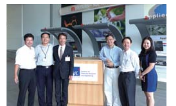
Collaboration with IMRE

The Seraya Plant's Technical Service Center initiated joint research with the Institute of Materials Research and Engineering (IMRE), a research organization under the auspices of Singapore's Agency for Science, Technology and Research. We will promote R&D themes that originate in Singapore.