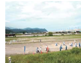
Cleanup activity along the Himekawa River

In addition, to help preserve the environment of local community, we are participating in the Himekawa River Cleaning Mission, a public-private initiative undertaken during the river preservation month designated by the Japanese government, with the aim of helping to keep the river environment clean.