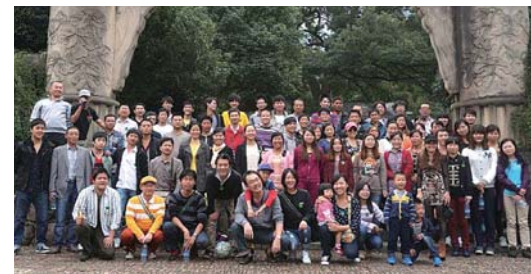
Employees on a company trip organized in October 2013

To facilitate communication among employees, we hold annual company trips while holding sports festivals every year. We believe that building harmonious relationships between employees is key to creating a safety-oriented corporate culture and securing business growth. In line with this belief, we will undertake these and other activities to invigorate communication.