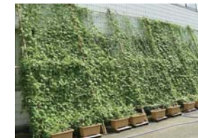
Bitter melon vines climbing the wall of the plant's office building

The “green curtain” refers to a greenery initiative in which vines are planted around buildings so that they climb and cover walls and windows. By doing so, they provide shade and cool air through evaporation while contributing to CO 2 reduction. We participated in a competition hosted by the Ichihara City aimed at promoting this initiative.