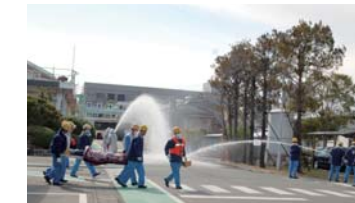
Comprehensive emergency drill

In addition, the plant was commended by the head of the Kanagawa Labour Bureau for its excellent track record in occupational safety and health initiatives.