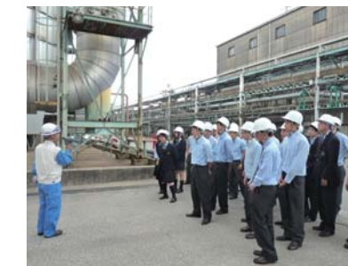
Local high school students touring plant facilities

In addition, under a program commemorating Ichihara City's 50th anniversary, we received a special prize recognizing our contribution to local industries.