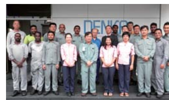
Merbau Plant staff