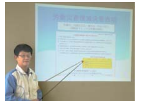
Mandatory safety training using video presentations

Going forward, we will continuously improve our facility security management system as well as occupational safety and health management system while facilitating a safety-oriented corporate culture. In these ways, we will maintain safe and stable plant operations.