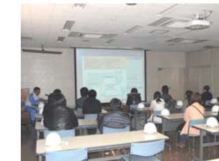
Teachers and parents on a plant tour

We cooperate with blood donation campaigns twice a year, with 291 employees donating blood in fiscal 2013 (cumulative total).