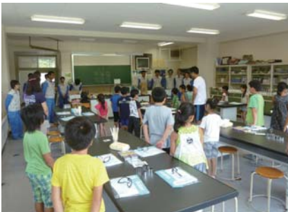
Science experiment class