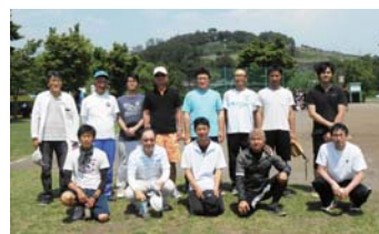
CRK staff joined a softball game hosted by DENKA Shibukawa Plant

In fiscal 2013 and 2014, we participated in softball games hosted by DENKA's Shibukawa Plant. While facilitating worksite communication, which we recognize is essential to safety, we address mental health issues by inviting external specialists to lecture employees.