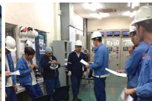
Reviewing operating procedure documents