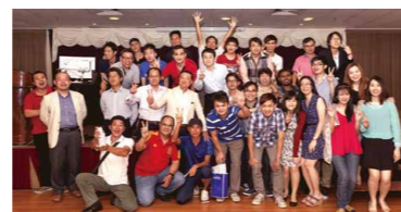
Plant staff at the dinner event

We hold dinner events not only to deepen ties among the plant staff but to commend our hard-working employees.