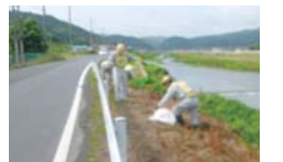
Cleanup activity undertaken around the Isazugawa River

To facilitate communication with on-site operators, we encourage our employees to write down their concerns in a shared notebook while addressing issues they have pointed out as in need of improvement. We will further enhance worksite communication by increasing opportunities for exchange, such as recreation events aimed at nurturing a sense of unity.