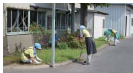
Regular cleanup and weeding activity

We conduct regular cleanup activities within and around our premises a member of the local community. Even though the impact of our operations on the environment is already relatively low, we continuously strive to reduce waste generation and enhance recycling rate while conserving energy.