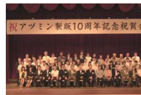
The 10th anniversary ceremony