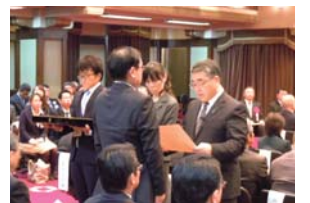
Receiving a commendation from the governor of Kanagawa Prefecture

We will continue to work to systematically reduce the environmental impacts of our plant operations.