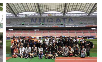
An excursion to the DENKA BIG SWAN STADIUM