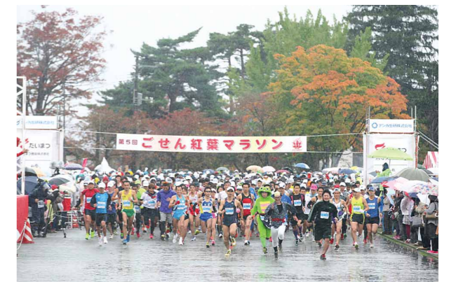
GOSEN KOYO MARATHON co-sponsored by DENKA SEIKEN

We hold periodic exchange meetings with neighborhood associations while proactively taking part in and co-sponsoring various local sports events to foster greater understanding of our operations as a healthcare business operator.