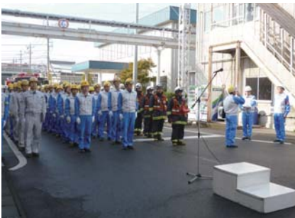
Comprehensive emergency drill