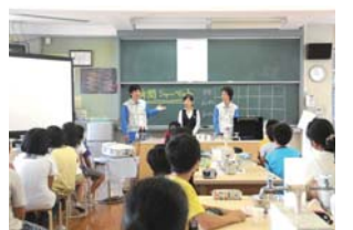
Chemistry class for children