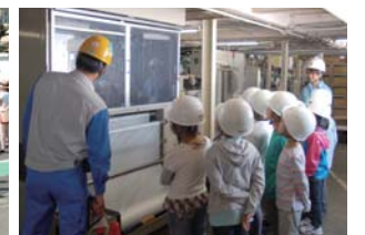
Local elementary school students on a plant tour