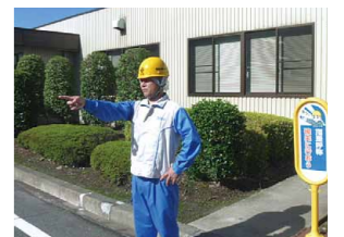
Practicing pointing and calling

entire workforce have resulted in the improvement of the plant's safety records, we will step up initiatives to facilitate a safety-oriented corporate culture, regularly refreshing worker's memories of accident countermeasures.