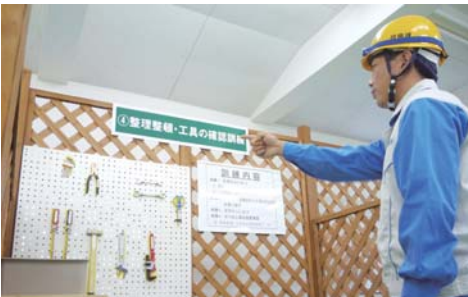
Practicing pointing and calling

In fiscal 2013, the Shibukawa Plant established the Discipline Training Room and Plant Maintenance Training Room with the aim of raising employees' safety awareness. The former provides on-site programs involving the practice of "pointing and calling" to make trainees realize the importance of such practice. The latter involves the use of the actual machine tools to make trainees aware of the dangers of misuse. Going forward, we will enhance the content of training programs designed for female workers as well as our mandatory job level-based training in addition to stepping up our ongoing safety activities.