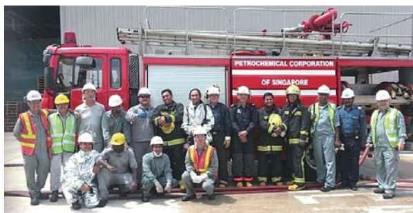
Joint emergency drill with PCS

*Petrochemical Corporation of Singapore (Pte) Ltd.