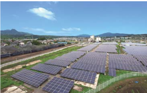
An aerial view of DENKA Solar Power Shibukawa

To promote the use of clean energy, the Shibukawa Plant established DENKA Solar Power Shibukawa, a mega solar power generation facility. The facility was established on the site of the former Yagihara Plant, putting it to effective use. Boasting a maximum output of 2.2MW, the facility is capable of supplying electricity equivalent to that consumed by 900 general households on an annual basis. All output is sold to Tokyo Electric Power Company. Looking ahead, we will strive to reduce resource and energy consumption as well as CO 2 emissions.