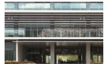
A louver window made from SUQCEM

In addition, we will promote tree planting to increase greenery in the center's premises.