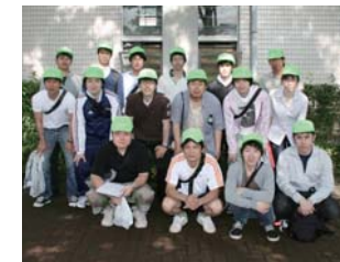
Plant employees who helped organize a marathon

We will continue with our community contribution efforts to maintain the trust of local residents.