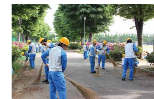
Cleaning a park near the plant