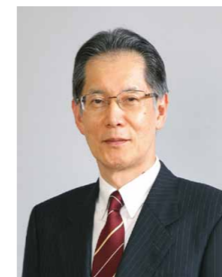
Tetsuro Maeda President

As we manufacture vaccines and diagnostic reagents aimed at protecting people's well-being, we have positioned maintaining the stable supply of high-quality products as our utmost social mission. Going forward, we will develop and manufacture products that are needed by people around the world, thereby combating the threat of various infectious and other diseases.