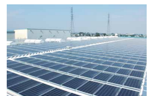
Solar power generation facilities installed on the rooftop of the Ota Plant

In addition to maintaining zero-emission status going forward, we will systematically reduce the volume of industrial waste generated by our facilities, with an eye to utilizing limited natural resources in a sustainable manner.