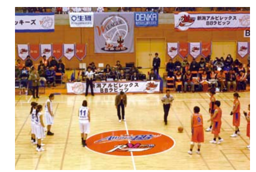
The Albirex BB Rabbits (in orange) on the court in Gosen City

We proactively support local sports events, for example, serving as a "one-day sponsor" for the NIIGATA Albirex BB Rabbits when they participate in annual tournaments held in Gosen City. This professional female basketball team wears uniforms provided by Denka Co., Ltd. In this and similar ways, we are working to interact with people in communities.