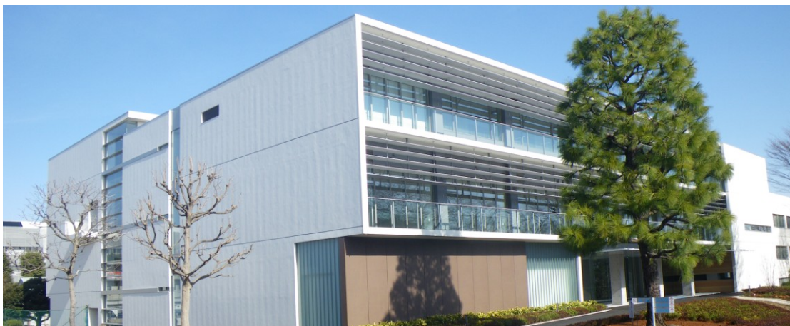
The nearly completed main building of the DENKA Innovation Center

(please refer to the attached chart for details).